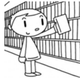
at the library