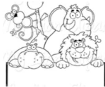
at the zoo