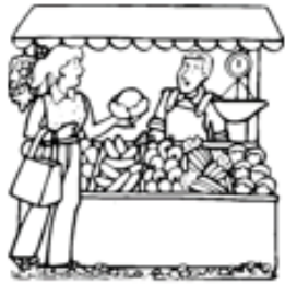
at the market