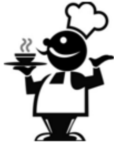
at the restaurant